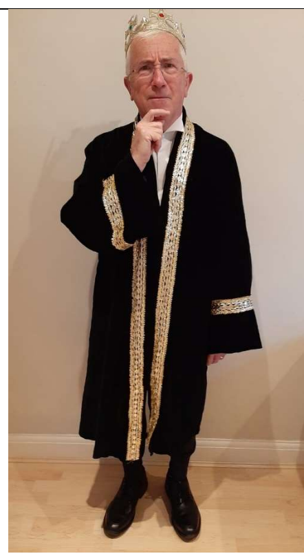
King Wally The Once -Mark Cosstick